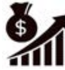
Average HH Income